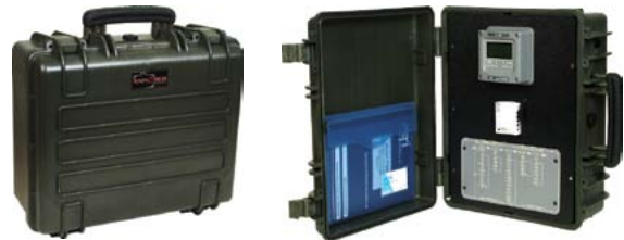
PQ45 Portable PAA Data Logger

The perfect solution for temporary monitoring from a few days to a few weeks!