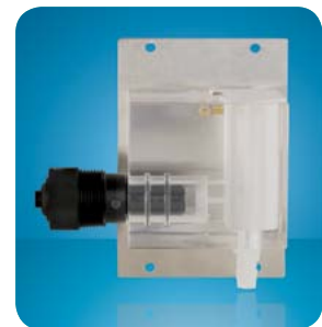
Constant Head Flowcell