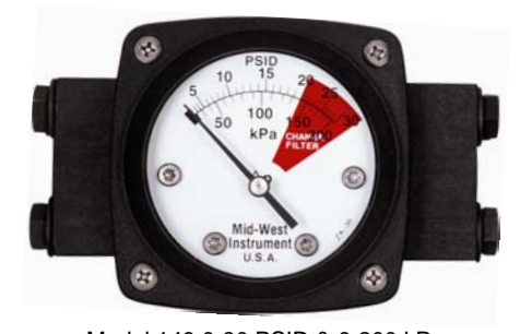
Model 140 0-30 PSID & 0-200 kPa with 2-1/2" Dial & Special Color Dial