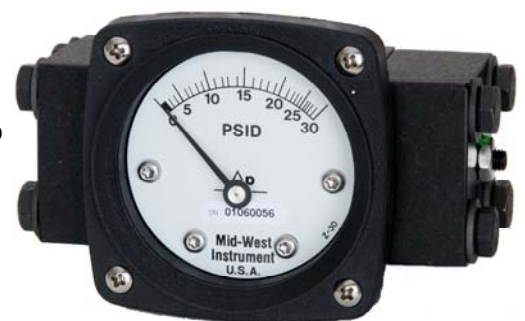
"A World Leader in Differential Pressure Gauges, Switches & Transmitters