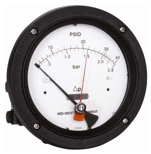
Model 140 0-40 PSID & 0-2.8 Bar with 4-1/2" Dial& maximum follower pointer