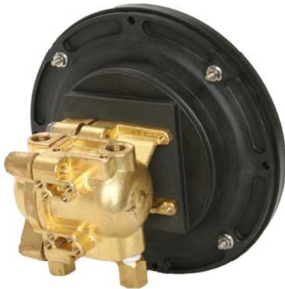
Model 116 Brass Cast Body

Model 116 can be equipped with one or two independently adjustable SPDT snap acting Micro-Switches which can be set on decreasing or on increasing pressure. A switch adjustment screw and a switch lock screw is accessible after removal of the lens and bezel (removal of 4 screws). Interface to the snap acting micro-switch is via color coded 18 AWG flying leads and a 1/2" FNPT conduit connection. Model 116 with switch temperature limits are rated at -20°C to +185°F