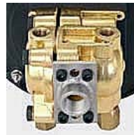
Optional 3/4" FNPT Stub Mount Shown