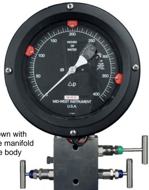
116 switch unit shown with Optional S.S. 3-Valve manifold mounted to gauge body