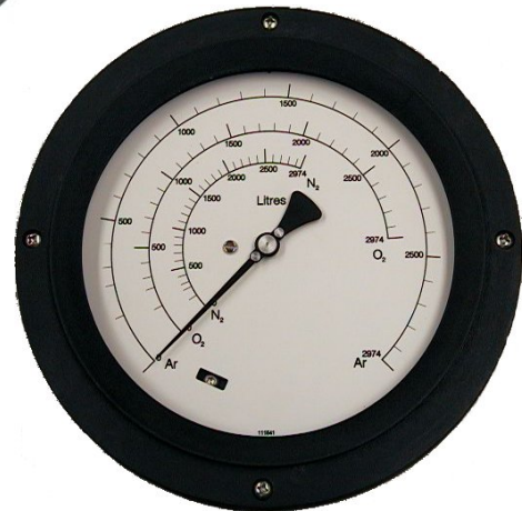
Ar, O 2 , N 2 Tri-Scale Dial