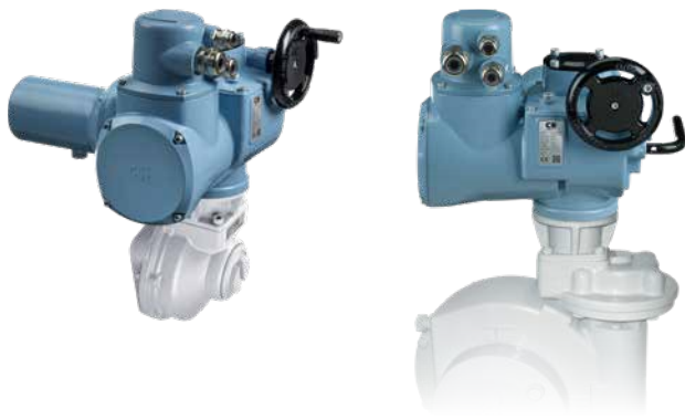
CK actuators plus Rotork second stage gearboxes

Thrust base types are separate to the gearcase allowing easy installation. Should the actuator be removed, the base can be left on the valve to maintain its position. All base dimensions and couplings conform to attachment standards ISO 5210 or MSS SP 102.