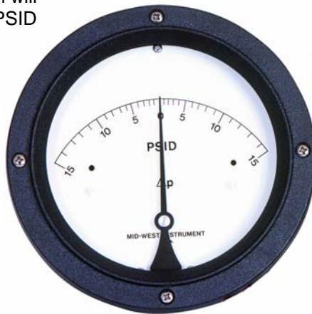
Model 120 15-0-15 PSID 4-1/2" Dial Bi-Directional