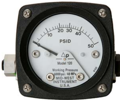
Model 120 0-50 PSID 2-1/2" Dial

A low cost differential pressure gauge for use in measuring the pressure drop across filters, strainers, separators, valves, pumps, chillers, etc., and for local flow indication and control.