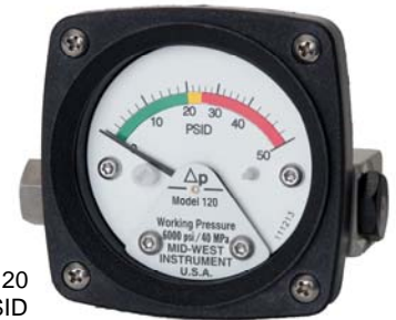
Model 120 0-50 PSID With Special 3 Color Dial

An optional maximum indication follower pointer provides automatic indication of maximum differential occurring during a time period or system cycle. Reversed pressure ports are optionally available to facilitate installation and readability depending on which side of a filter, etc., the instrument must be installed.