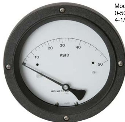
Model 122 0-50 PSID 4-1/2" Dial