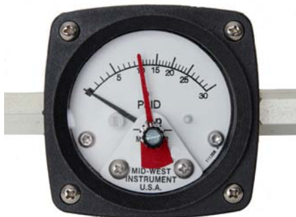
Model 122 0-30 PSID 2-1/2" Dial w/Maximum Follower Pointer

Due to precision sizing of piston and body bore, leakage across piston will not exceed 15 SCFH air at 100 PSID at ambient temperature.