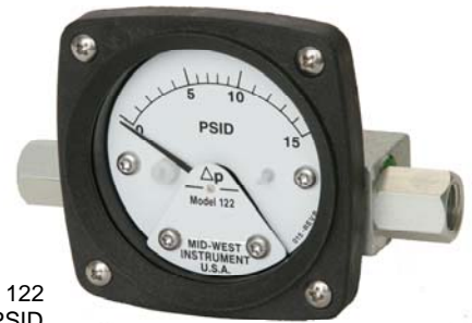
Model 122 0-15 PSID

An optional maximum indication follower pointer provides automatic indication of maximum differential occurring during a time period or system cycle. Reversed pressure ports are optionally available to facilitate installation and readability depending on which side of a filter, etc., the instrument must be installed.