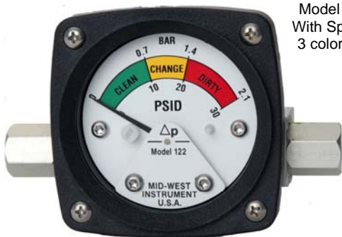
Model 122 With Special 3 color dial

A low cost differential pressure gauge for use in measuring the pressure drop across filters, strainers, separators, valves, pumps, chillers, etc., and for local flow indication and control.