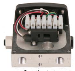
Open back view Model 121 reed switch with terminal strip