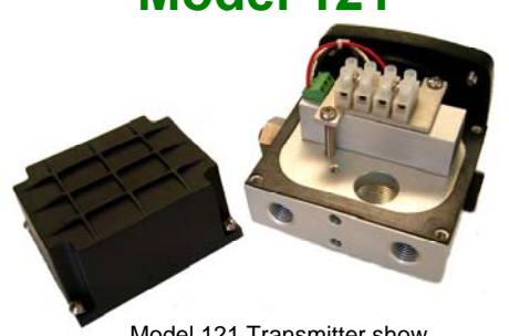
Model 121 Transmitter show with NEMA 4X plastic cover