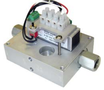
Open view Model 121 Transmitter 4-20 mA terminal strip w/ 1/4" FNPT end connections

Piston-Type Differential Pressure Gauges are available with one or two hermetically sealed reed switches. The switches are adjustable within a defined percentage of the full scale range of the gauge and are available in SPDT and SPST, normally open or normally closed configurations for various load/power ratings. The switches can be set to activate or deactivate on rising or falling pressure. Switches are "CE" marked per the EU low voltage directive. Models 121 can be configured for use in Hazardous Locations.