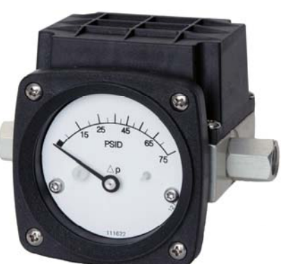
Model 121 0-75 PSID 2-1/2" Dial. Shown with End Connections & Transmitter