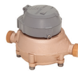
Recordall® Disc Flow Meters