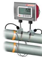
Dynasonics® Ultrasonic Flow Meters