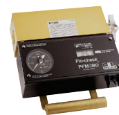
Flo-tech Hydraulic Fluid Testing