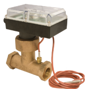
Impeller Flow Meters