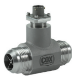
Cox® Turbine Flow Meters