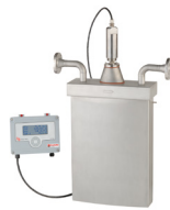
Coriolis Flow Meters