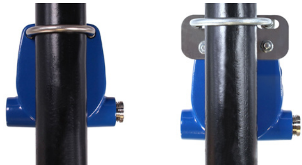
Figure 1: Rear Views of PDA6631 (left) and PDA6863 (right) (both mounted on 1.5" pipe)