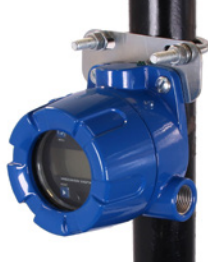
PDA6863 Pipe Mounting Kit for 2" Pipe