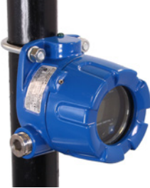
PDA6631 U-Bolt Kit for 1.5" Pipe

1.5" & 2" Pipe Mounting Solutions for PD663 Exp-Proof Loop-Powered Meter