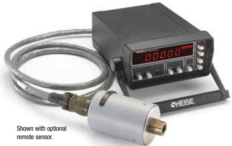
Shown with optional remote sensor.